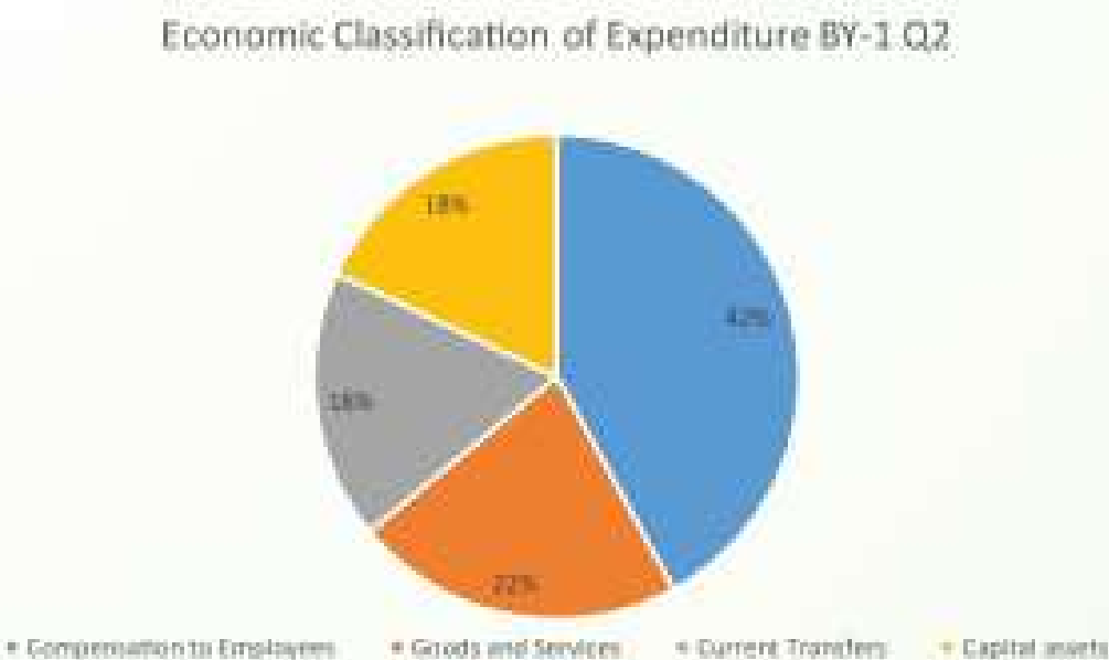
Figure 1.1 shows that the county is still struggling to contain its wage bill within the 35% limit prescribed by the PFM Act 2012. Capital spending is also below the target of 32% for the year, but is fairly high for the second quarter compared to last year (25% this year versus 18% last year at the end of Q2).